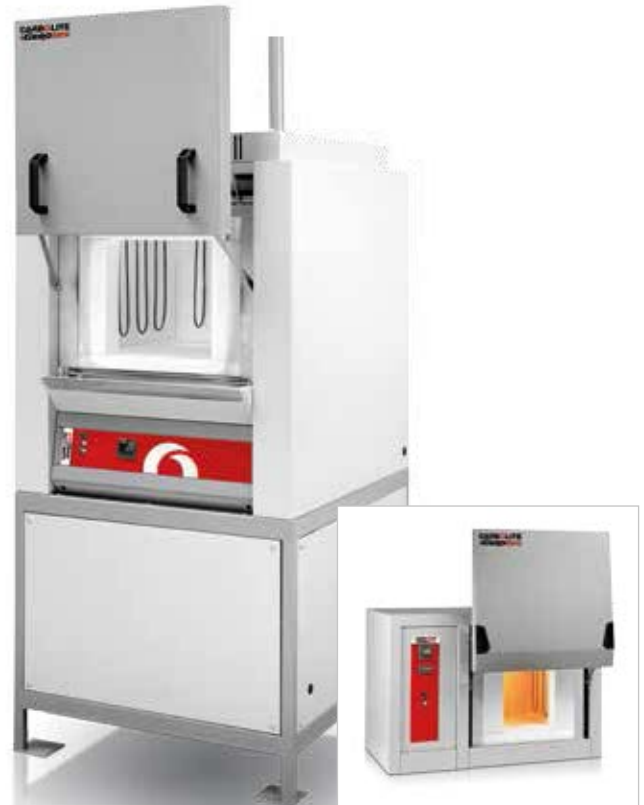
HTF 18/27 & HTF 17/5